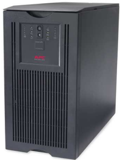
APC Smart-UPS XL 2200VA