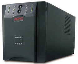
APC Smart-UPS XL 1000VA